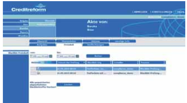
Graphical user interface of the CrefoSystem Web solution

Via an Internet browser, the CrefoSystem Web solution is used to check your business contacts against all the relevant sanction lists. The result of the verification is always returned in realtime.